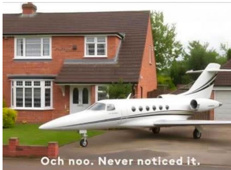
Och noo. Never noticed it.